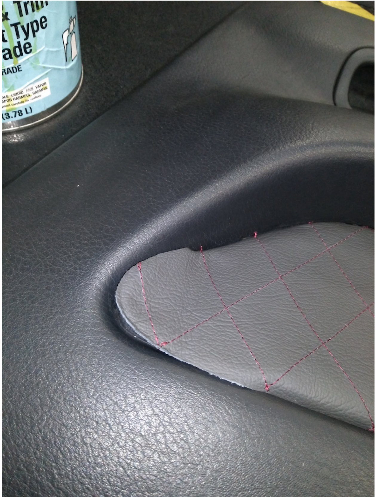
You are using the same method of applying adhesive and letting it tack up on the rest of the door panel.