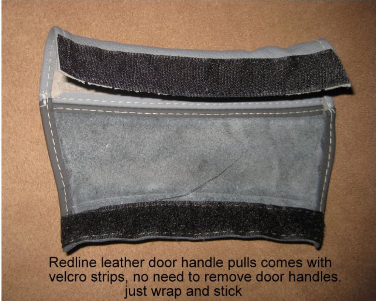
Redline leather door handle pulls comes with velcro strips, no need to remove door handles. just wrap and stick